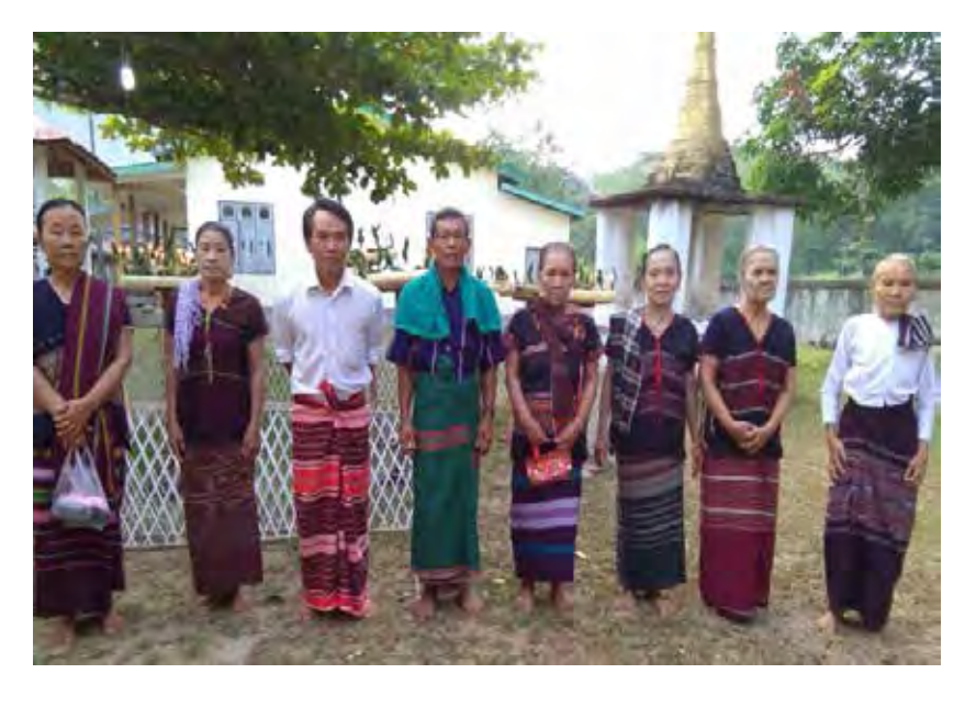
Photo (8) The group of Sprit Medium for propitiation in Du wai Zedi

In this study area, Mawchala is not only diviner but also a spirit medium. Maw means spirit and Chala means teacher. There are two types of Mawchala (spirit medium) by gender. They are female and Male Mawchala. The majority of the Mawchala are females. Mawchala can also cure sickness and if necessary, perform harmful as well as evil spirit. Spirit worshippers believe that spirits could support and provide economic, health and social matters, so, if they make offerings to the worship spirits in various ways. So, the Mawchala helps them because Mawchala know exactly how to propitiate the spirit. Their income would be 2000kyats to 5000kyats from people who come to the Du wai rituals. According to information given to massage the relationship between Du wai and Poe Kayin spirit worshippers, successful in this ritual it depends on the important role of Mawchala (spirit medium). But most villagers depend on the advice of Mawchala every time they face with the problem concerning.