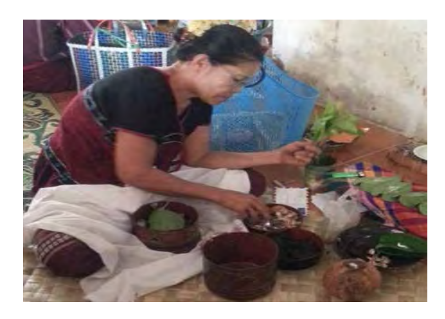
Photo (11) The spirit medium preparing the offering items from the bride

On the auspicious wedding day, they need to vow at Shin Du wai Zedi and Thitsar Man Tine Zedi built by Shin Du wai. For making vow at Shin Du wai Zedi, groom holds up a coconut which is used to pour as consecrated or blessed water and bride takes special betel box wrapped with white cloth and in which, offerings are contained. There are betel, betel nut, tobacco, bitter tonic and beeswax in the special betel box and all those things are needed to be made by the couples. Moreover mordacious plants, turmeric, a pack of sticky rice, and a pack of rice and other offertory also placed in it. When the couple arrived at the Zedi, the groom needs to clean and punch the coconut tip outside of the Zedi's compound.