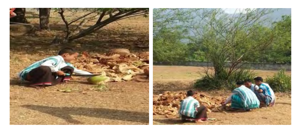
Photo (12) The groom preparing the coconut used in making a promise

On the auspicious wedding day, they need to vow at Shin Du wai Zedi and Thitsar Man Tine Zedi built by Shin Du wai. For making vow at Shin Du wai Zedi, groom holds up a coconut which is used to pour as consecrated or blessed water and bride takes special betel box wrapped with white cloth and in which, offerings are contained. There are betel, betel nut, tobacco, bitter tonic and beeswax in the special betel box and all those things are needed to be made by the couples. Moreover mordacious plants, turmeric, a pack of sticky rice, and a pack of rice and other offertory also placed in it. When the couple arrived at the Zedi, the groom needs to clean and punch the coconut tip outside of the Zedi's compound.